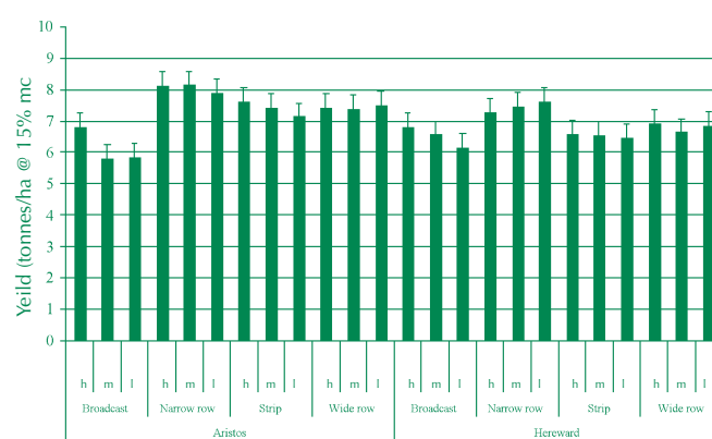
Figure 2: Grain yield (tonnes per hectare at 15% moisture content) for varieties Aristos and Hereward, across 4 drilling arrangements (broadcast, narrow row, strip and wide row) for three seed rates (high(h): 250kg/ha, medium (m): 200kg/ha, and low (l): 150kg/ha) at the Wakelyns trial site. The error bars indicate the s.e.d. = 0.8703, l.s.d. = 0.4385

spatial distribution of wheat plants in the narrow row drilling arrangement resulted in higher yields (Figure 2). In the field there was reduced plant density per coulter in narrow rows compared to the equivalent seed rates for the wide row systems. The higher yields that can be achieved with improved wheat plant distribution, are equivalent to less well distributed seeds (i.e. such as in wide rows) but with higher seed rates. Wheat plants do have a capability to buffer development relative to competition, such that more tillers per unit area exist at high competition, but with fewer grains per head. At low competition there is an increased grain mass per ear but yields remained higher at high seed rates. Clearly the economics of seed rate to yield advantage will influence the viability of these agronomic criteria.